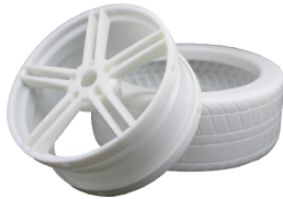
Tire Model Sample Piece