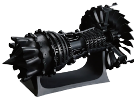
Precision model manufacturing