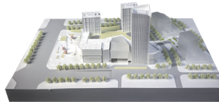
Building model of real estate company

Auto Parts Manufacturing Home Appliance Parts 3C Electronic Products