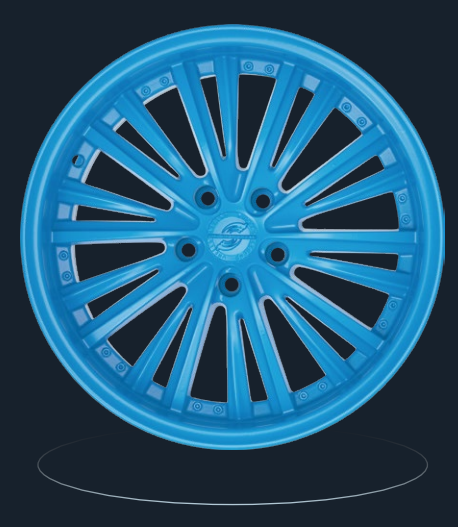
Wheel Hub 18 inch 8J