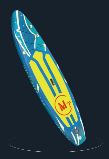
Paddle Board 3200 × 770 × 130 mm