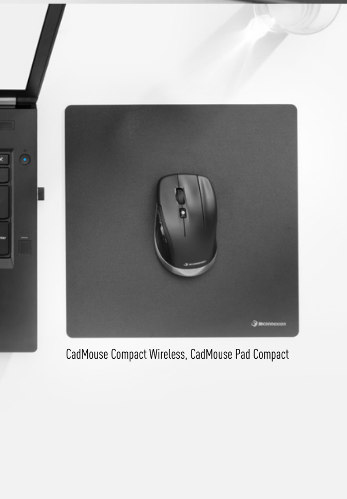
CadMouse Compact Wireless, CadMouse Pad Compact

Dedicated Middle Mouse Button – the days of clicking the mouse wheel are over thanks to the CadMouse's intelligent ergonomic design.