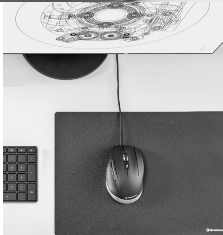
CadMouse Compact, CadMouse Pad

See website or contact us for details of supported applications.