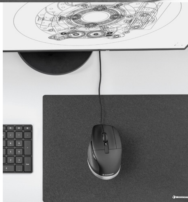
CadMouse Pro, CadMouse Pad

See website or contact us for details of supported applications.