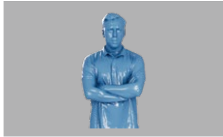
| Human Digitization