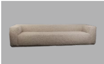
| 3D Display